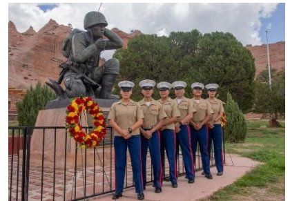
80th Anniversary of Navajo Code Talkers – Window Rock AZ